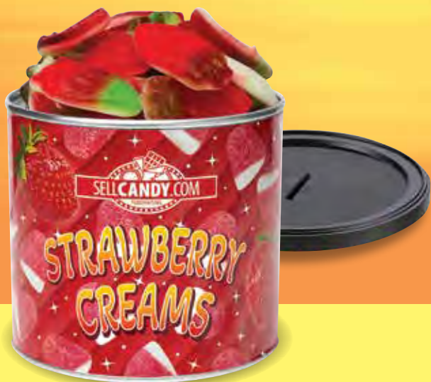
1006 • Strawberry Creams • $14 Strawberry gummy atop a pillow of marshmallow. 6 oz.