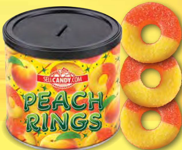
1005 • Peach Rings • $14 Gummy chewy goodness with a sweet peach flavor. 6 oz.