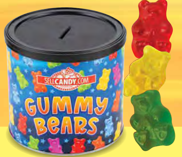
1001 • Gummy Bears • $14 Fruit flavored gummy bears are an all-time favorite. 6 oz.