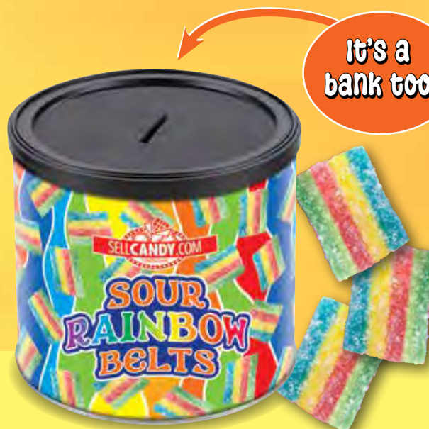
1009 • Sour Rainbow Belts • $14 Bursting with sour fruit flavor and a tangy sweetness. 5 oz.