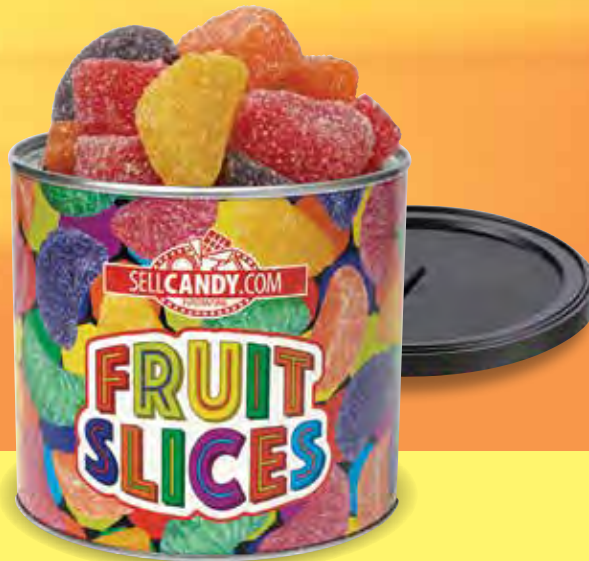
1008 • Fruit Slices • $14 Fruit flavored chewy wedges in delicious fruit flavors. 6 oz.