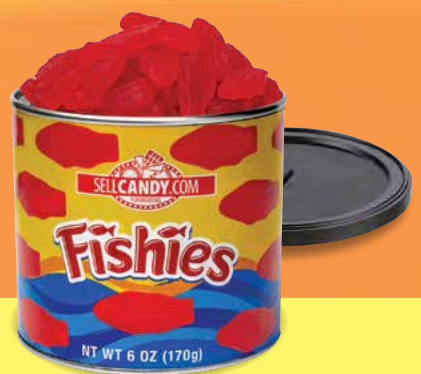
1007 • Fishies • $14 Chewy and fruity red fish shaped gummy candy. 5 oz.