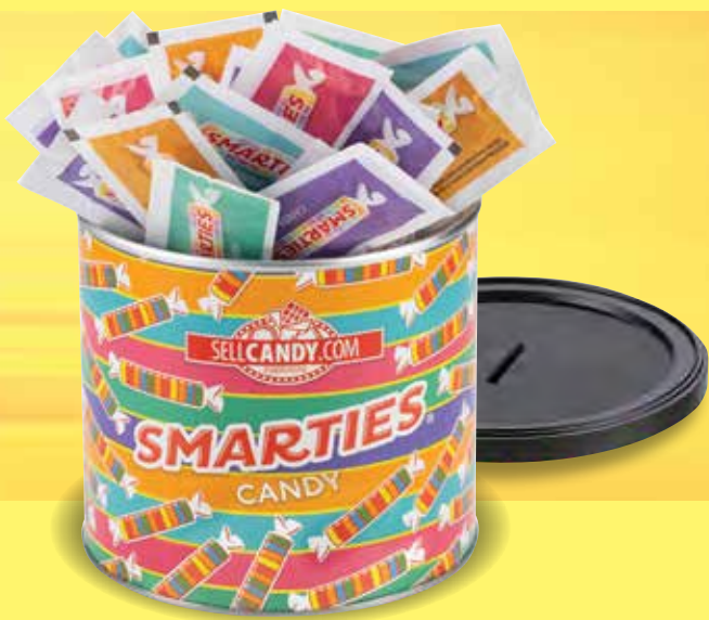
1003 • Smarties® Candy • $14 Classic Smarties® candy in tasty colors and flavors. 6 oz.