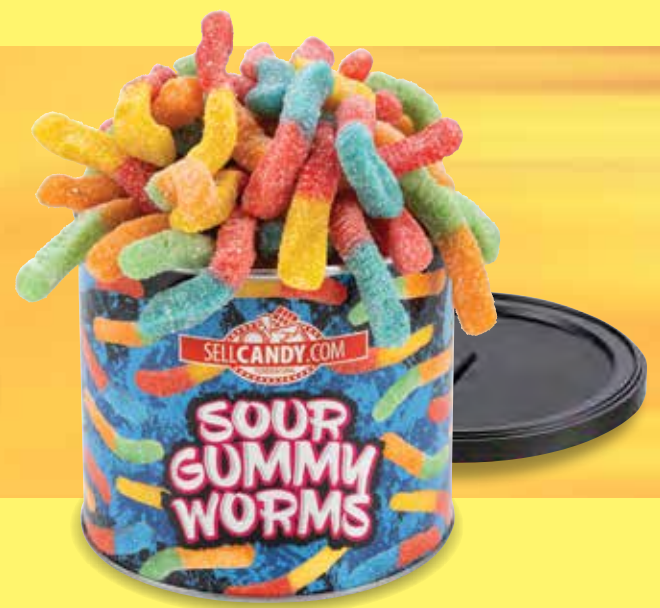
1002 • Sour Gummy Worms • $14 Soft and chewy gummy worms that start off sour then turn sweet. 6 oz.