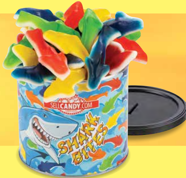
1004 • Shark Bites • $14 Colorful two-layered gummy sharks with white bellies. 6 oz.