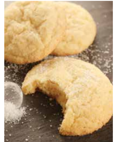
423 ● $25.00 SUGAR

(Masa de galleta con mantequilla de cacahuete) Reminiscent of Grandma's oven fresh cookies. We make ours with chunky peanut butter, too!