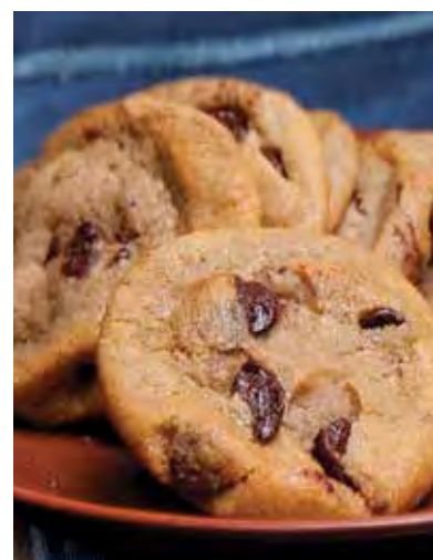
420 ● $25.00 CHOCOLATE CHIP

Shelf-stable gourmet cookie dough does not require refrigeration for a prolonged period to maintain freshness; refreeze it safely at home. Preportioned cookie dough pucks make baking a cinch!