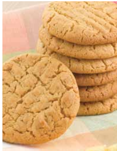
422 ● $25.00 PEANUT BUTTER

(Chocolate de leche con pacana) Milk chocolate chips, pecans, and creamy brown sugar cookie dough make a delightful and sweet reward.