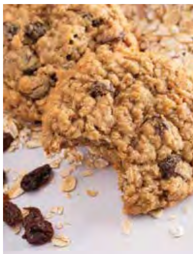
425 ● $25.00 OATMEAL RAISIN

(Masa de galleta con trocitos de chocolate blanco y nueces de macadamia) Crunchy macadamia nuts, melt-in-your mouth white chocolate, and a soft, chewy base.