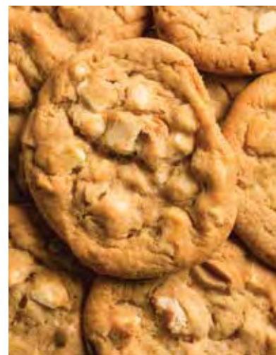
424 ● $25.00 WHITE CHOCOLATE MAC

(Masa de galleta con azúcar) Sugar Cookies are a sweet and tender cookie with wonderfully crisp edges. They are an American favorite.