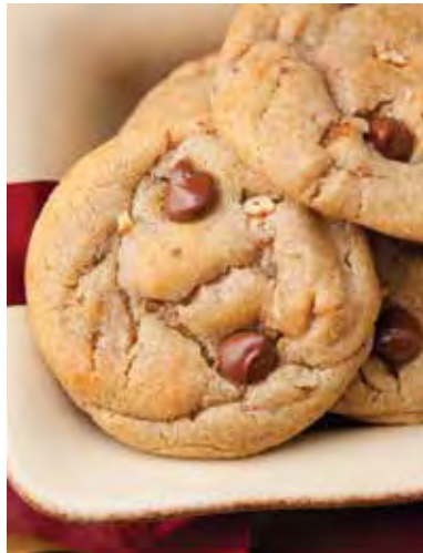
421 ● $25.00 MILK CHOCOLATE PECAN

(Masa para galletas con trocitos de chocolate) A generous amount of chocolate chips in a "just like homemade" cookie dough. Cookies don't get any better than this!