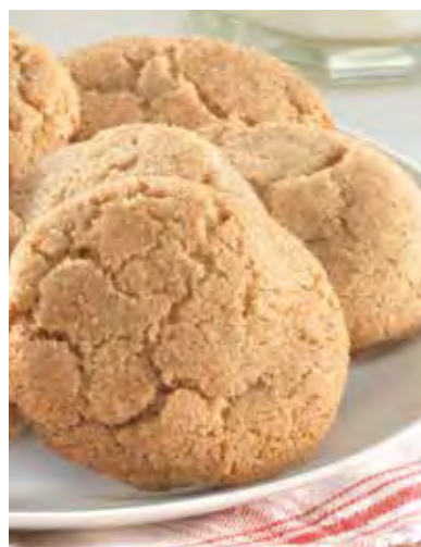
426 ● $25.00 SNICKERDOODLE

(Masa para galletas con avena y pasas) Fragrant cinnamon and moist chewy oatmeal raisin dough is sure to bring back childhood memories!