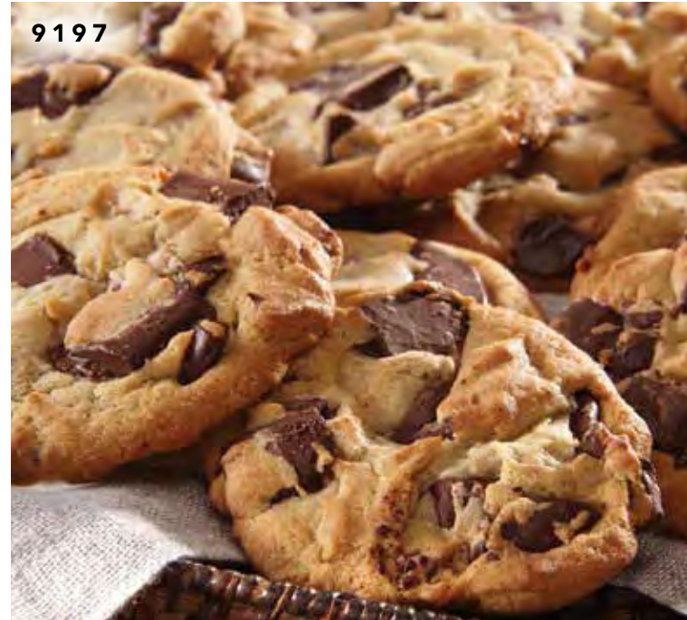
9197 CHOCOLATE CHUNK COOKIE DOUGH

Avena y pasas. This delicious dough is filled with plump raisins, savory warm spices, and the perfect amount of oats, making every grandma jealous of our recipe! ①D Contains: