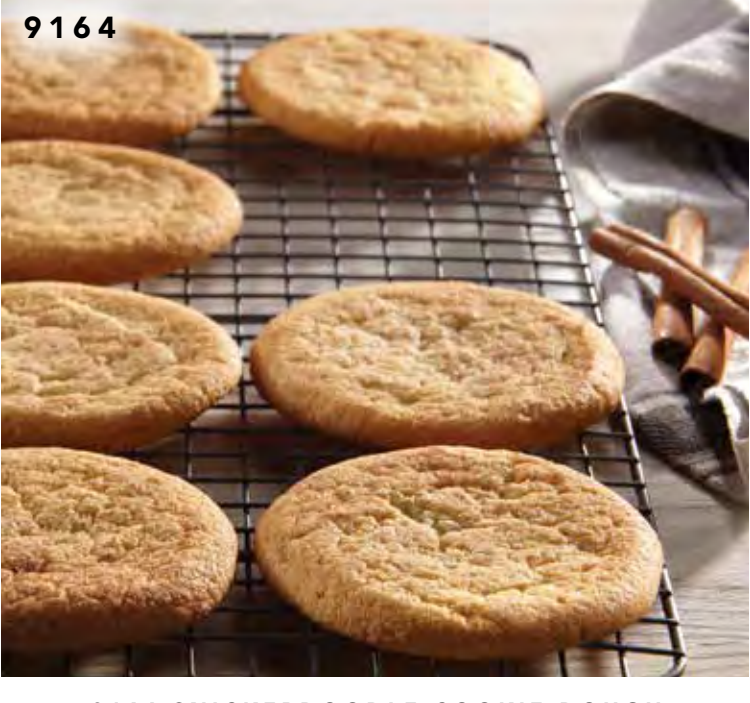
9164 SNICKERDOODLE COOKIE DOUGH

Dulce. Bright and colorful chocolate candies are loaded into our signature cookie dough, making this treat something to look forward to! Contains: