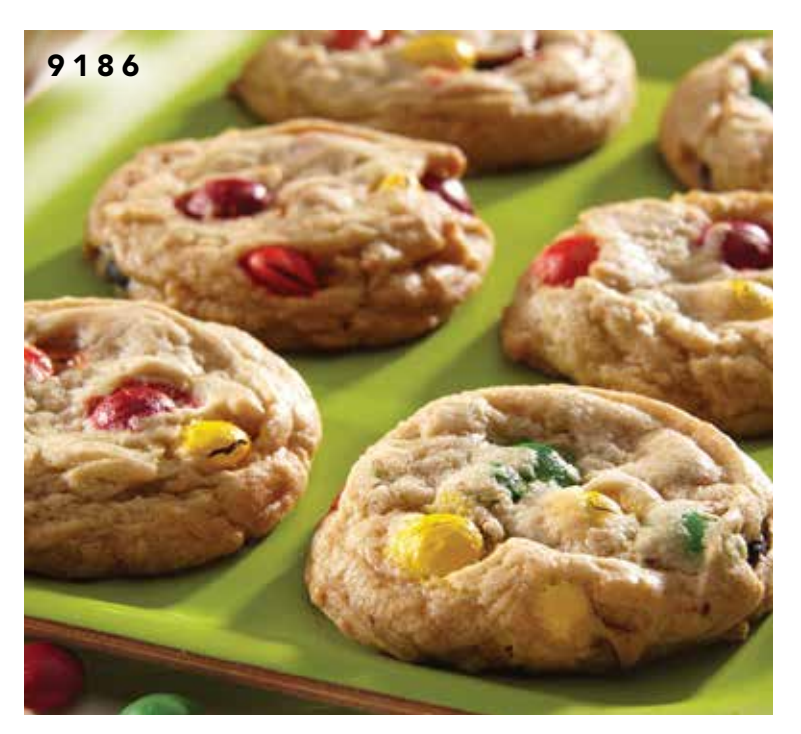
9186 RAINBOW CANDY COOKIE DOUGH

Dulce. Bright and colorful chocolate candies are loaded into our signature cookie dough, making this treat something to look forward to! Contains: