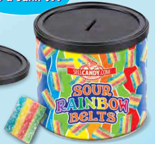
1009 • Sour Rainbow Belts • $14 Bursting with sour fruit flavor with a tangy sweetness. 5 oz.