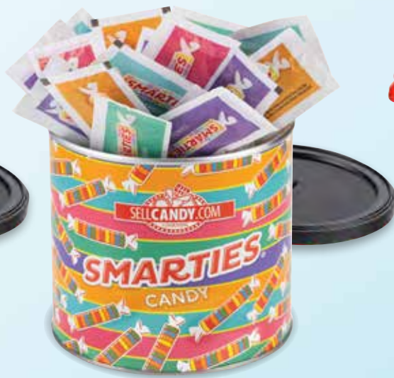
1003 • Smarties® Candy • $14 Classic Smarties® candy tablets in tasty colors and flavors. 6 oz.