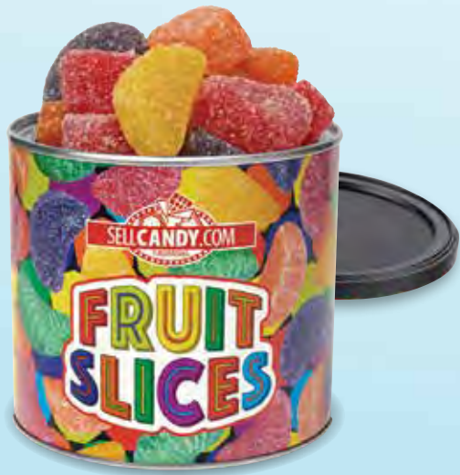
1008 • Fruit Slices • $14 Fruit flavored chewy wedges in delicious fruit flavors. 6 oz.