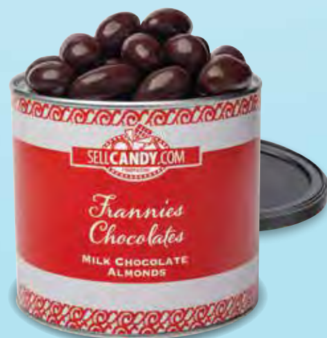
1010 • Milk Chocolate Almonds • $15 Whole crunchy almonds covered in smooth chocolate. 5 oz.