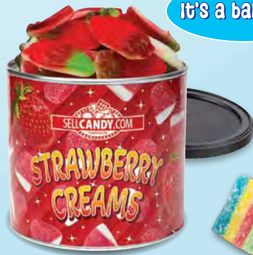
1006 • Strawberry Creams • $14 Strawberry gummy atop a pillow of marshmallow. 6 oz.