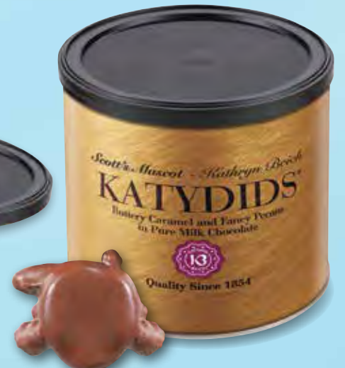
298 • Katydid's® • $17 Soft chewy caramel, pecans and milk chocolate. 8 oz.