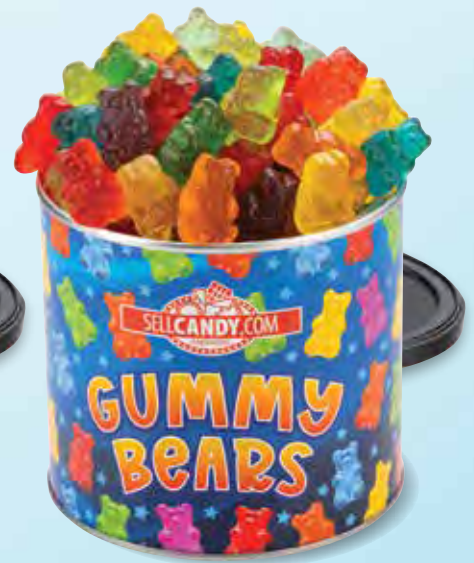
1001 • Gummy Bears • $14 Fruit flavored gummy bears are an all-time favorite. 6 oz.