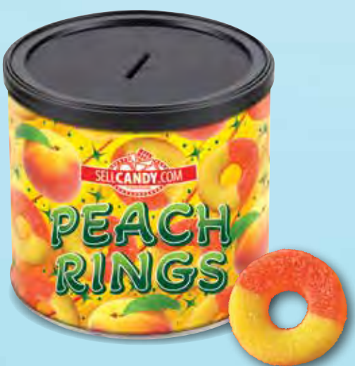
1005 • Peach Rings • $14 Gummy chewy goodness with a sweet peach flavor. 6 oz.