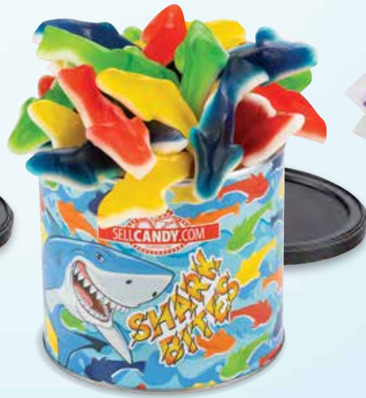
1004 • Shark Bites • $14 Colorful two-layered gummy sharks with white bellies. 6 oz.