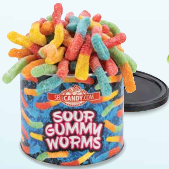
1002 • Sour Gummy Worms • $14 Soft and chewy gummy worms that start off sour then turn sweet. 6 oz.