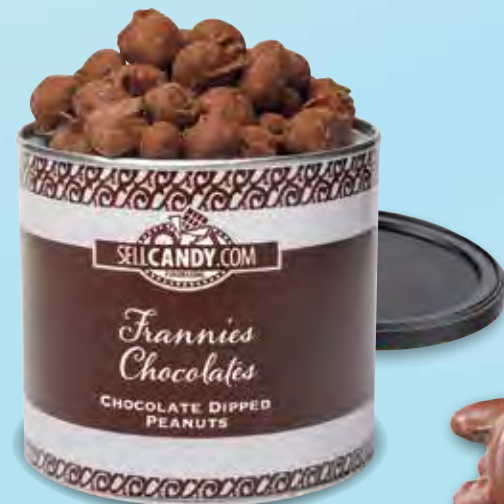
1011 • Chocolate Dipped Peanuts • $15 Roasted, salted peanuts dipped in creamy chocolate. 7 oz.