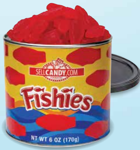
1007 • Fishies • $14 Chewy and fruity red fish shaped gummy candy. 5 oz.